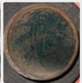
Biofilm in a piping system