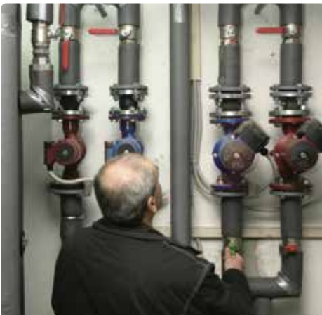
Piping system in an apartment building