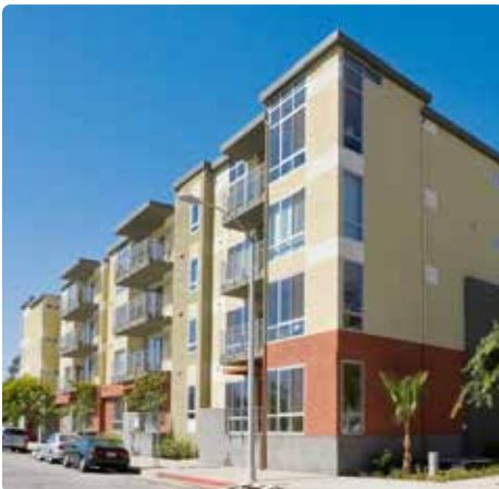
Large residential complex