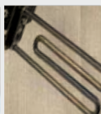
Heating element in a hot water tank