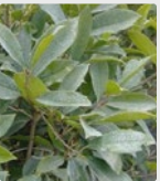
Plants and turf